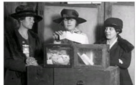
Three suffragists voting in New York City (circa 1917). The original caption read, Calm about it...the women voters showed no ignorance or trepidation, but cast thier ballots in a businesslike way that bespoke study of suffrage.

Again, thanks to all of you. Don't forget to vote in this absolutely history-making election and let's make sure our representatives at all levels know how we feel about important issues.