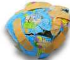
A world in need of repair . . .

"We can work together for a better world with men and women of goodwill, those who radiate the intrinsic goodness of humankind. To do so effectively, the world needs a global ethic with values which give meaning to life experiences and, more than religious institutions and dogmas, sustain the non-material dimension of humanity. Mankind's universal values of love, compassion, solidarity, caring and tolerance should form the basis for this global ethic which should permeate culture, politics, trade, religion and philosophy. It should also permeate the extended family of the United Nations." Wangari Maathai, 2004 Nobel Peace Prize winner